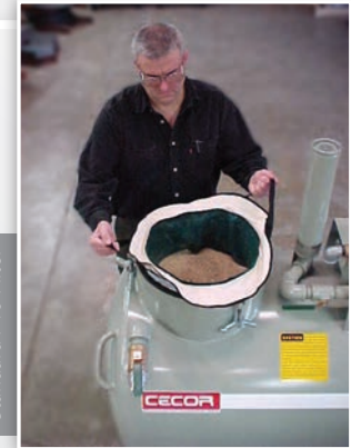
Standard F10 Filter

The F10 strainer basket and fabric liner has a capacity of 1.0 cubic foot and is standard on the SA5. The reusable filter has built in grips and is small enough for one person to lift. Coarse, fine and polypropylene filter bags come standard with the F10 filter basket.