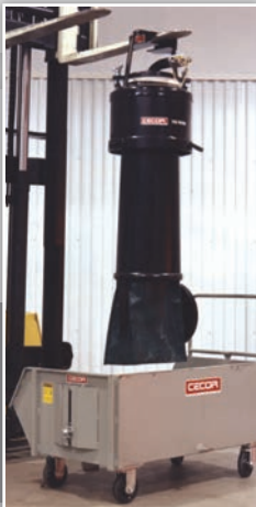
Optional F23 Filter

Available as a combination-tank sump cleaner and coolant dispenser – CA5 Sump Shark .